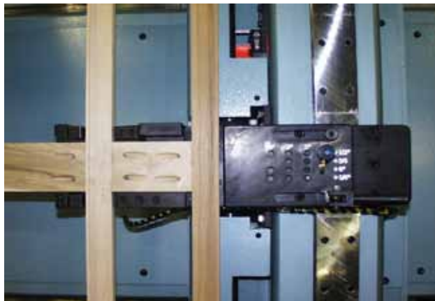
Horizontal mullion clamp assemblies for 1-1/2" mullions, vertical mullion clamp assembly for 3" mullion. Mullion clamp assemblies for other sizes produced upon request.

The ProMax Face Frame Assembly Machine is an affordable system that squares and clamps common sizes of base and wall cabinet face frame material allowing manual fastening procedures. Production rates of 300 to 400 frames per eight hour shift are possible depending upon the frame configuration. Standard joy stick operation allows quick and accurate size adjustments. Down clamps are included to insure flush joints prior to fastening. The frame is ergonomically designed at an angle for easy placement of sub-assembled frame parts and fast removal of the finished product. Operating controls are simple and convenient to minimize training time. Machine functions are air powered with programmable electrical controls for accurate and reliable operation.