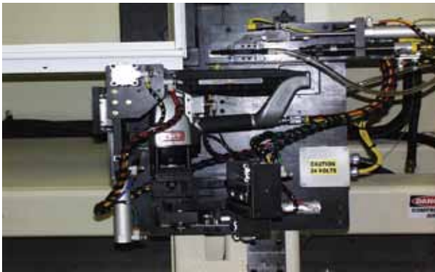
Down clamp assemblies are located on each of the four corner base plates

The Premier Frame Clamp squares and fastens a variety of materials, dimensions and cross-sections. This semi-automatic frame assembly clamp features fast and infinite product height and width adjustment within the minimum and maximum constraints of the machine. The Premier Frame Clamp is specifically designed to accommodate the fastener of your choice in the locations that you desire. The four fastening modules include fastening tools, safety sensors, fastener placement shift assemblies and down clamps. Machine functions are air powered with programmable electrical controls for accurate and reliable operation.