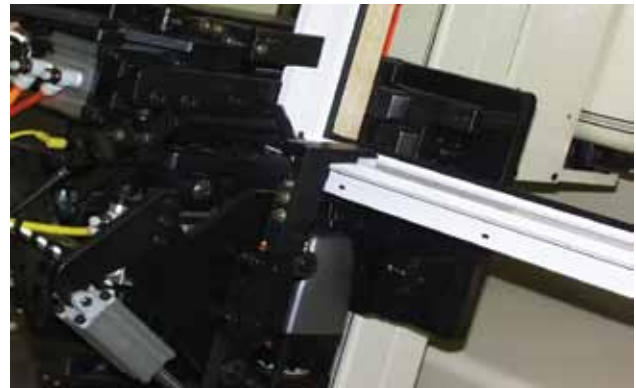
Optional screwdriver units can be purchased to screw together cladding. All screwdrivers use automatic depth control, ensuring proper screw engagement and reducing tool wear.