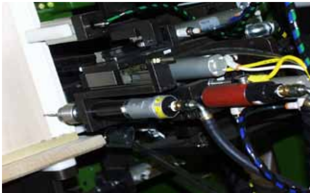
Drawer slide predrill assembly

The Premier Drawer Slide Machine has been designed to predrill, clamp and fasten drawer slides to cabinet and furniture drawers. The machine design as standard has four screwdriving tools, two for each drawer slide. Each screwdriver tool can shift along the length of the drawer slide driving screws in different locations as required by the length of the drawer and slide pilot hole locations. Drills are incorporated to pre-drill pilot holes needed for the drawer slide screwdrivers. This machine is designed to accommodate different face front offsets. Machine functions are air powered with programmable electrical controls for accurate and reliable operation.