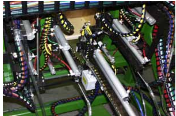
Drawer front screwdriver assemblies