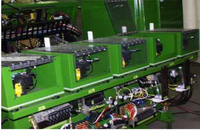
Bowl feeder assemblies